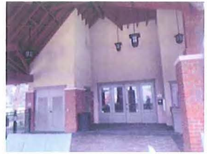
Repaint and re-stain as shown ceilings walls doors trim mask