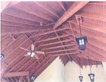
Re-stain wood ceiling area over a rear porch area and all walks etc.