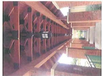
Walkway ceiling in fence to be painted covering mask break as