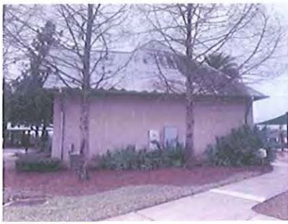
Same as above