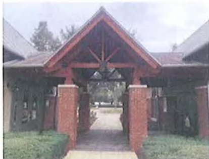
Same as above