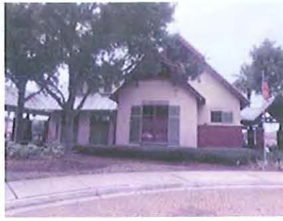
Front elevation including painting of shutters stucco soffits trim