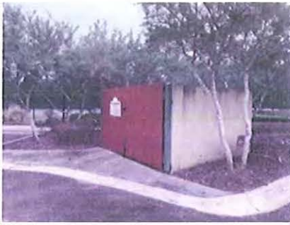
Dumpster enclosure included inside and out