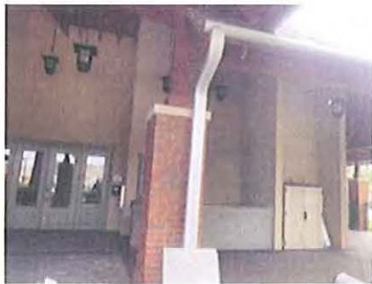
Same as above