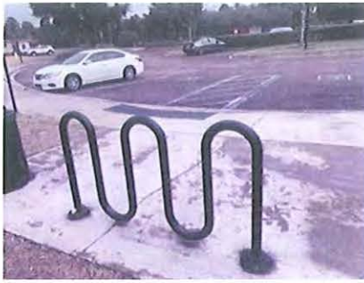
Repeat bike included