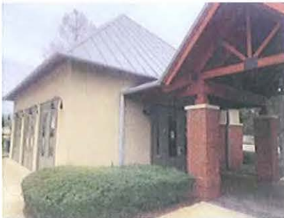
Same as above repaint stucco soffits windows mask covering