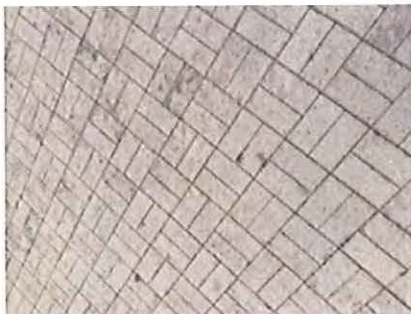
Pressure clean pavers at entry areas to Gym and multifunction