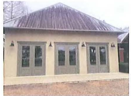
Same as above we have included pressure washing of all Galv metal